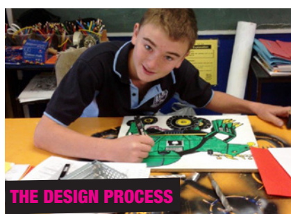
THE DESIGN PROCESS