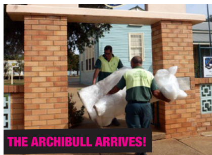
THE ARCHIBULL ARRIVES!