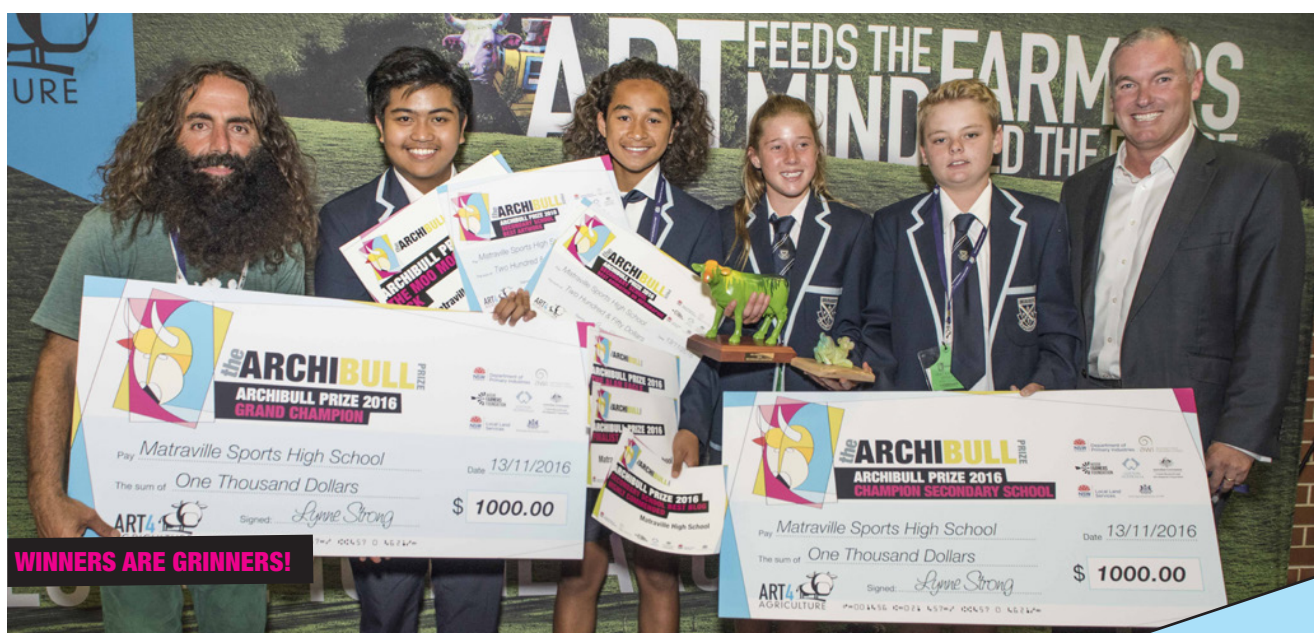
WINNERS ARE GRINNERS!